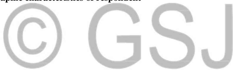
Table 2: demographic characteristics of respondent

terms of university, 142 (45.2%) attended state institutions while 172 (54.8%) attended private ones. In terms of the highest degree the academic staff had earned, 188 (59.9%) had a master's degree, 82 (26.1%) had a doctorate, 28 (8.1%) had a bachelor's degree, and 16 (5.1%) had a postgraduate diploma. Academic staff evaluated 108 (34.4%) small classrooms and 206 (65.6%) large classes in terms of class size