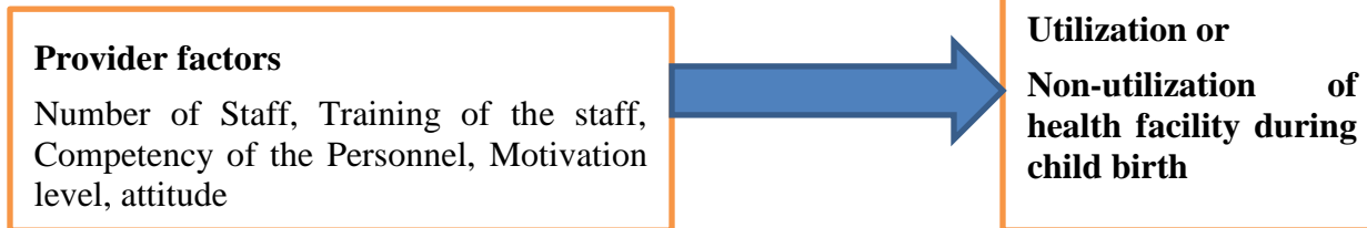
Figure 1 Conceptual Framework