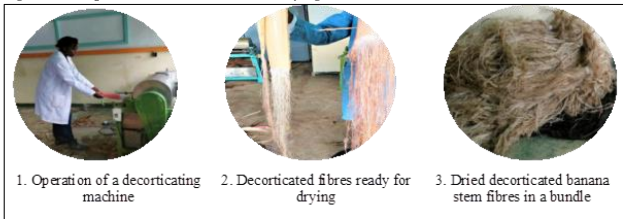
Figure 1: The process of decortication and drying of BS fibres

The fibres from the banana stems were extracted using a decorticating machine. 50 stems were decorticated. The decorticated BS fibres were washed and sun-dried. Figure 1 shows the decorticating process.