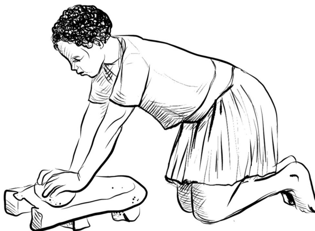
Figure 2. African women (grinding millet). Adaptation of the original photo of a Matabele woman, Africa, 1930s. The drawing was reproduced with permission from Mary Evans Picture Library, www.maryevans.com .

In traditional societies of East Africa, elderly women who had previously gone through initiation rituals were key in mentoring young girls into womanhood. According to Fair (1996), female initiates in Zanzibar between the 1890s and 1930s were taken through a series of lectures, dances, songs and demonstrations that related to a range of women's issues: male and female structures, the physical aspects of sexuality, desire and orgasm, masturbation and physical relations between men and