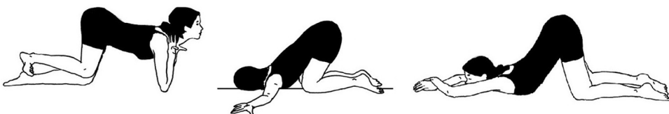
Figure 3. The graphics of Belarusian Gymnastics exercises.