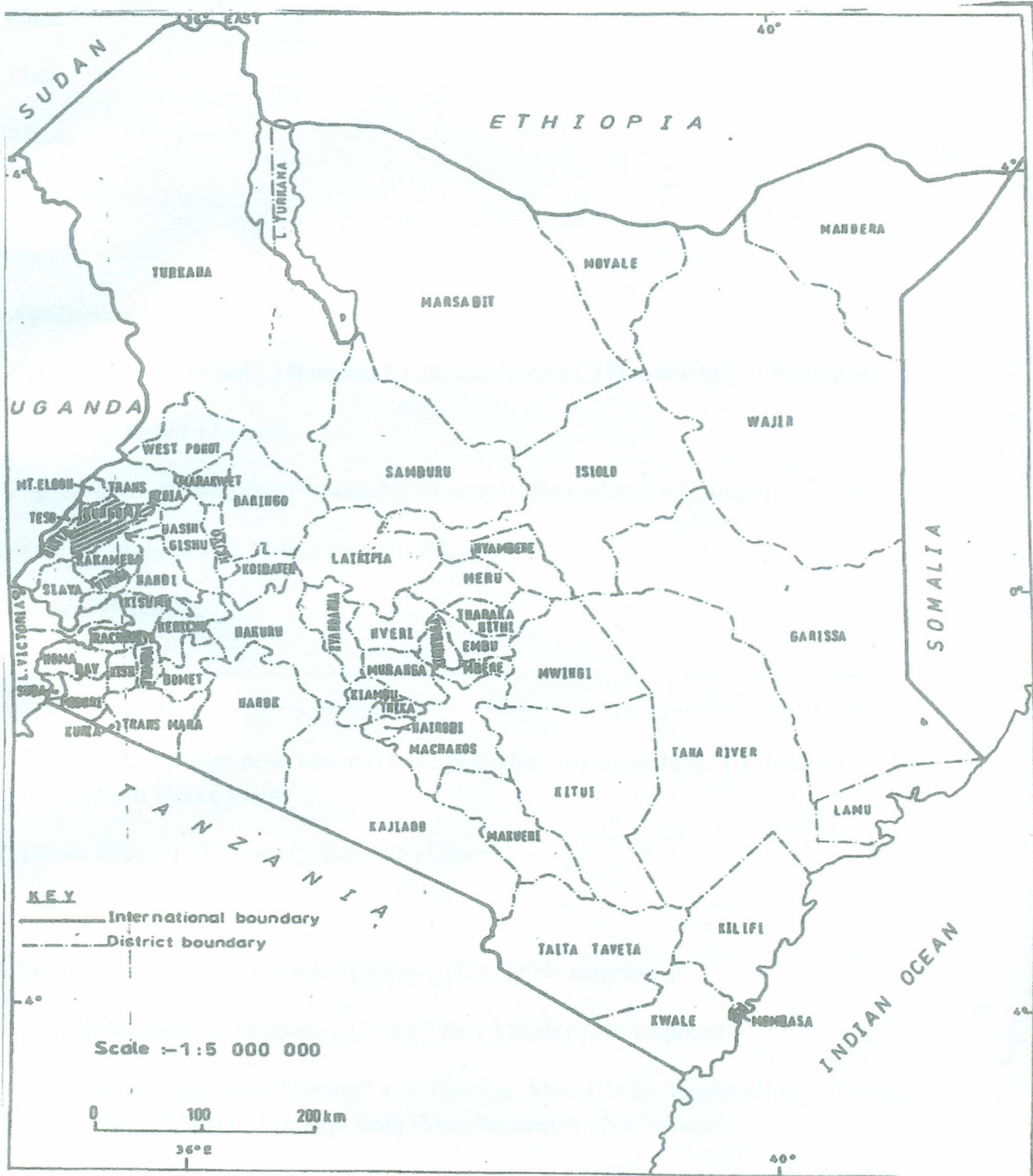
APPENDIX 1- Map of Kenya Showing the Location of the Study Districts