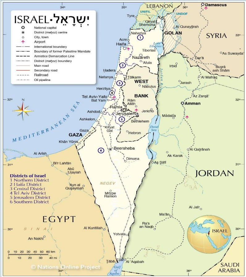
Figure 3. Today’s administrative map of Israel.

For laying claim on the 25% notch, deceitfully re-branded as Palestine; as if the 75% that is now Jordan was never part of the original Palestine, it becomes clear that the intention of the claimants is to erase Israel from the world map. The rallying call has remained “occupation of Palestine by the Jews and the right of