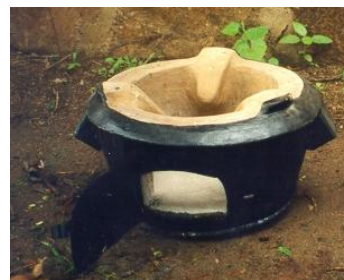
Figure 1: Portable fuelwood cooking stove

This is an improved type of stove which is more efficient in wood use. Firewood saving is mainly due to the fact that the fired clay liner ensures heat is retained in the stove over a long time. The fired ceramic liner provides the thermal insulation to minimize heat loss [11]. The stove can be fixed in the kitchen or can be portable by being enclosed in metal below. According to a research study done in Tanzania, a household using three stones stove consumes around 2880 kg/year of firewood. According to the study, through the use of improved firewood stove consumption is reduced to 1728 kg/year/household, annual saving is around 1152kg/household (equivalent to more than 20 trees/year) [12].