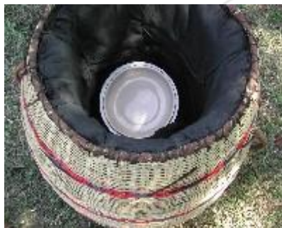
Figure 3: Fireless cooker (food warmer)

The first fireless cookers or hay stoves were boxes packed and made tight so as to conserve heat by insulation. Heat was put into food, and then it was quickly and closely shut into the insulator and did not lose its heat for many hours. Almost anything that can be boiled or steamed may be cooked in the fireless cooker with a great saving of the cook's time and labor as well as with an economy of fuel. There is a saving of work because the food does not need to be watched — it will neither burn nor boil over. Cooking utensils do not wear out so rapidly when used in a cooker as when used over a fire, and the kitchen is neither hot nor filled with odors. For Kenya, the most commonly used fireless cooker is made of a basket. This is basically an insulated cooking basket which helps to retain heat for a long time and therefore finalizing the cooking process without use of fire.