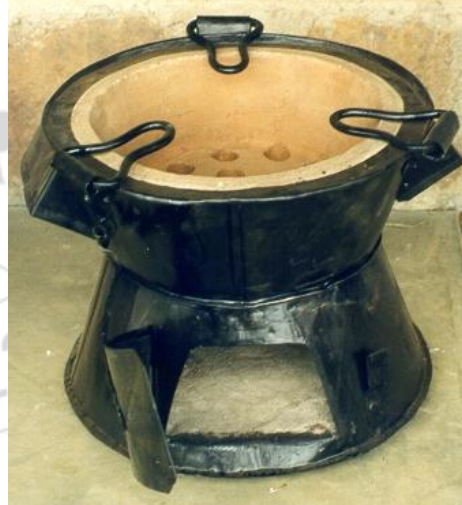
Figure 2: Kenya Ceramic Stove

The KCJ (Figure 2) stove was developed through a design process spearheaded by the Ministry of Energy. The jiko stove easily found acceptance among urban stove producers who were initially offered free training and marketing support by KENGO, working with the ministries of Energy, Agriculture, and Environment and Natural resources. Although most producers and dealers of the jiko stove have been men, many women in small urban areas have benefited immensely from the technology, significantly improving their standards of living through gains in time and income [5].