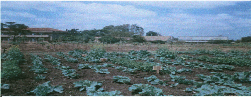
Plate 2 Field trial with mustard cabbage intercrop in the background and cabbage monocrop in the foreground