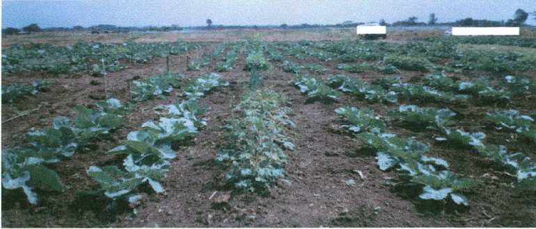
Plate 1: Field trial intercrops with cleome –cabbage intercrop in the foreground and coriander and mustard intercrops in the background