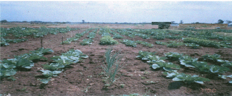
Plate 3 Field trial intercrops with the onion cabbage intercrop in the foreground and coriander and mustard intercrops in the background