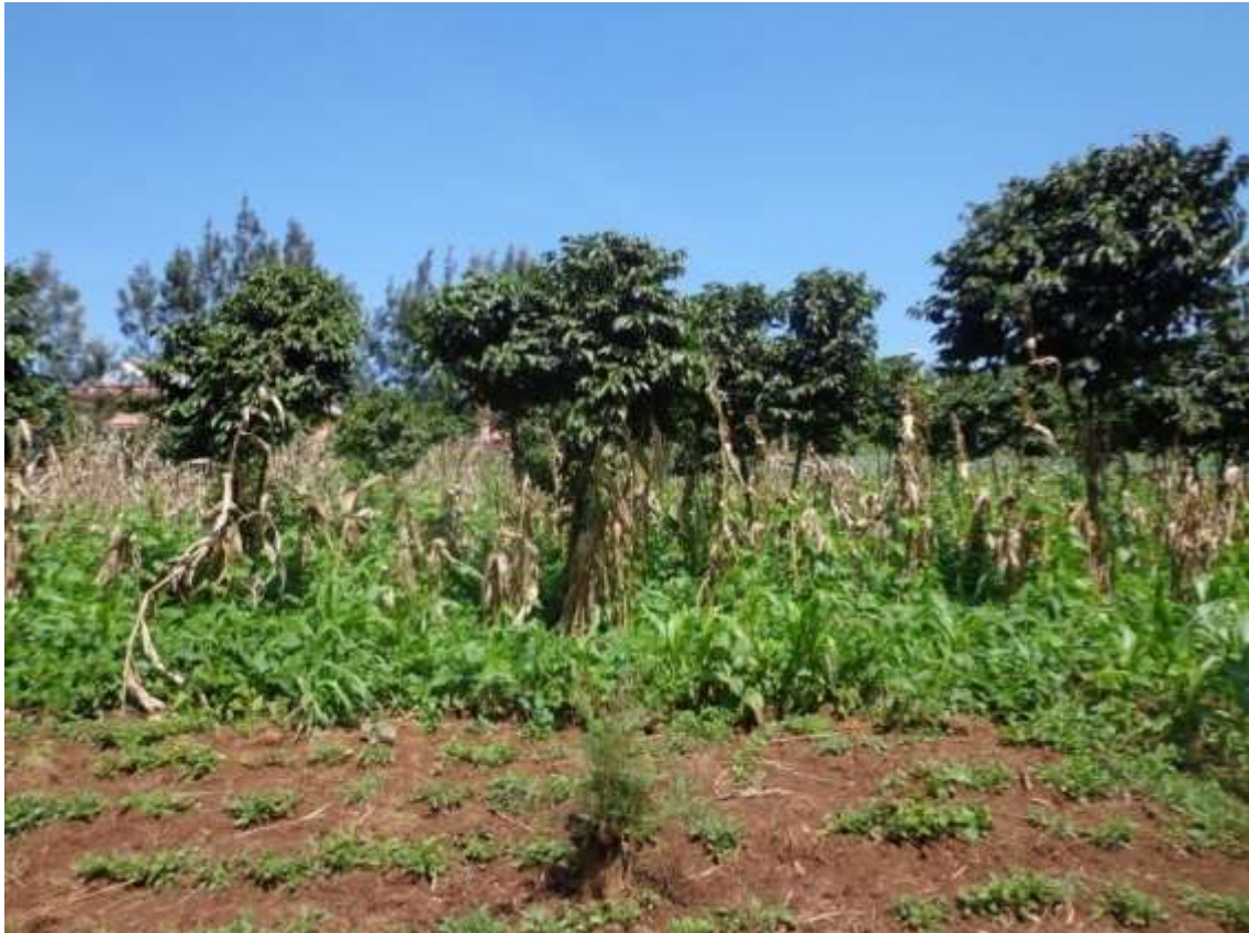
Plate 2.0: Maize and beans grown in coffee plantation

Source: Field Survey; (Photograph taken from Simbault farm on 9/6/2013 in Borabu Sub County)