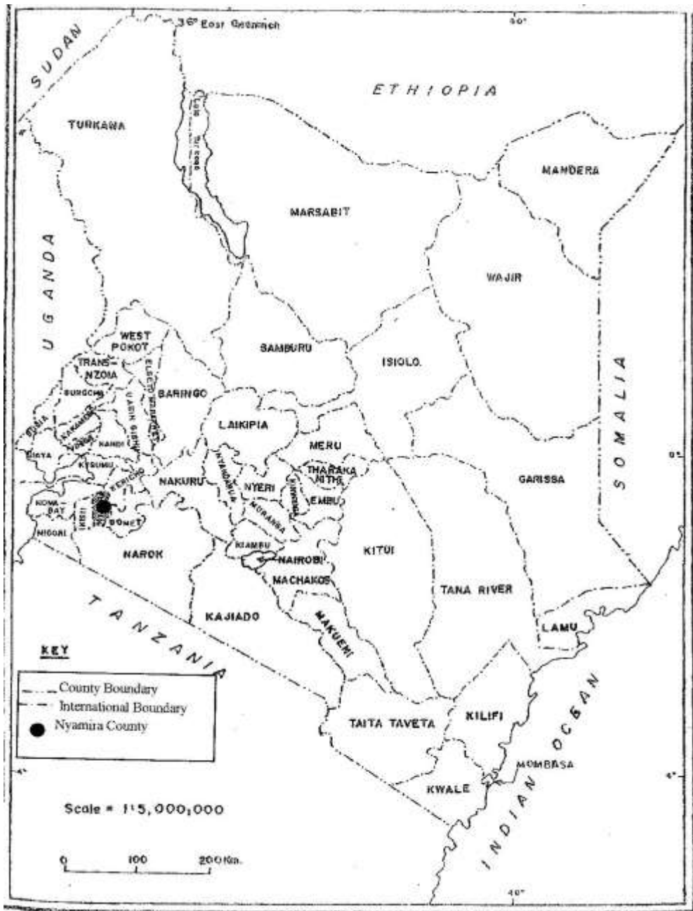
Figure 1.0: Map of Nyamira County in National Context