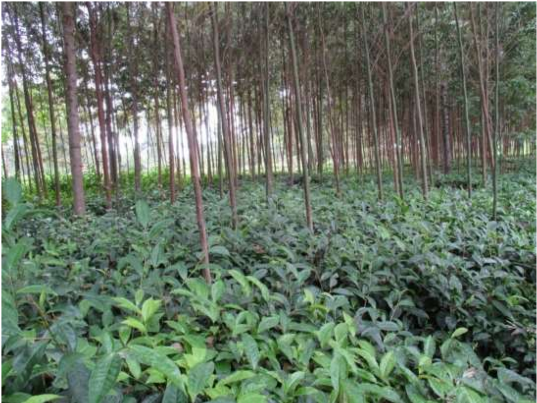
Plate 1.0: Blue gum trees planted in tea plantation

Source: Field Survey (Photo taken on 16/6/2015 from Onguso's farm in Masaba North Sub County)