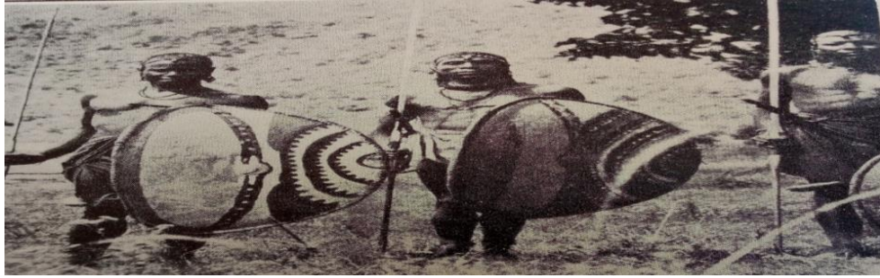
Figure 1: Elgeyo warriors with war shields.