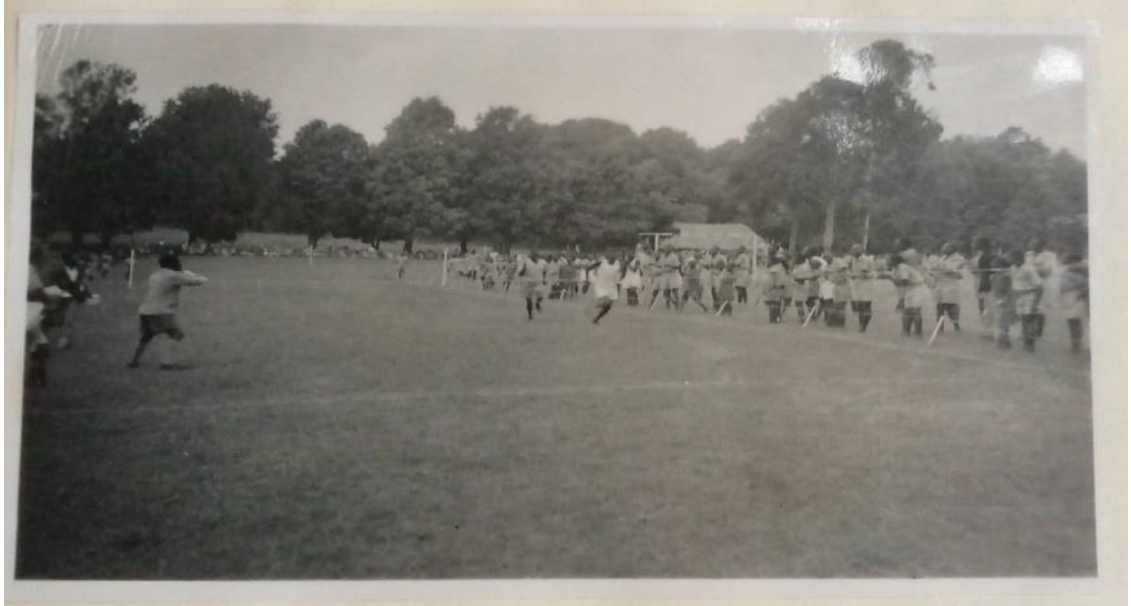
Figure 5: Rift Valley sports day at G.A.S Tambach in 1943