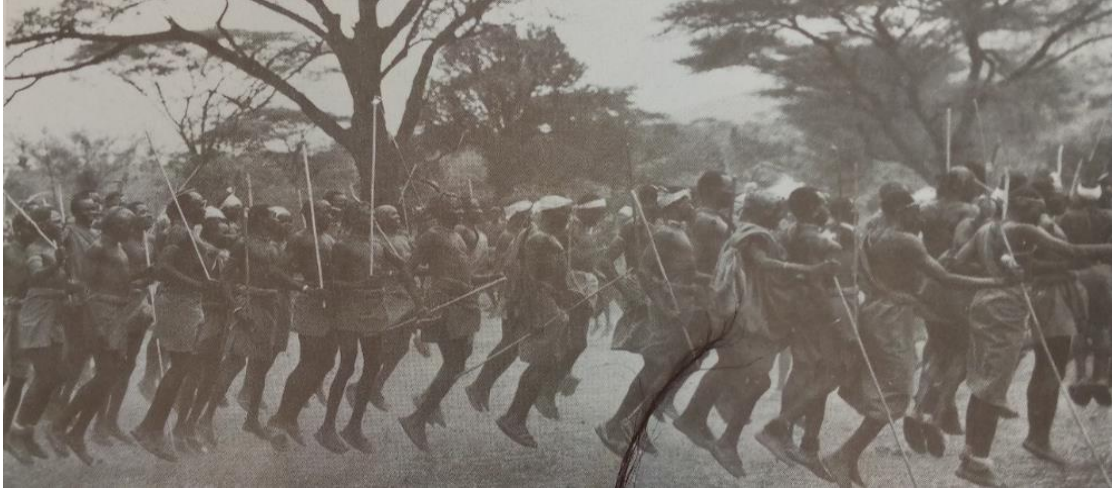
Figure 3: Marakwet Dancers at Kerio Valley (involved jumping) their dancing style.