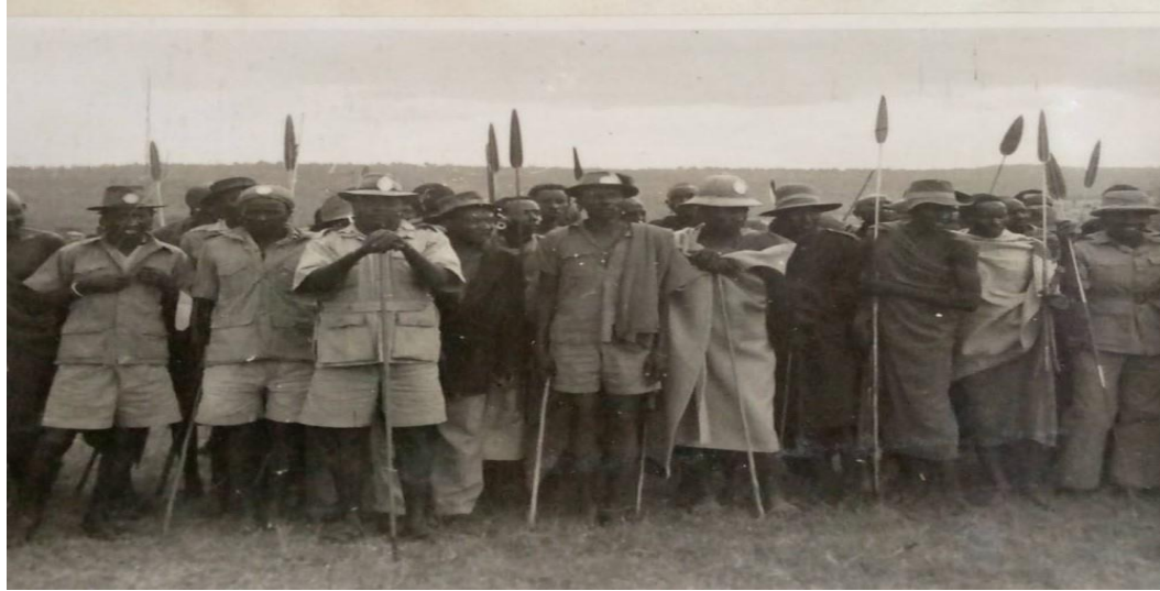
Figure 6: Elgeyo-Marakwet elders at A.I.M Sports Day at Kapsawor in 1938.