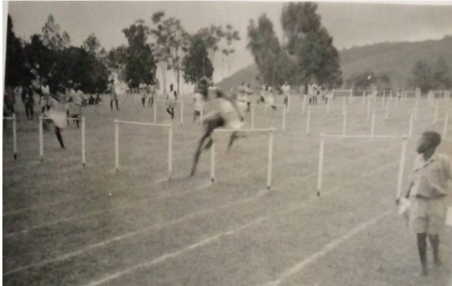
Figure 4: King's Birthday games in Kabarnet in 1933

points. These two pupils were selected to represent the Nzoia province at the Olympics African sports held in Nairobi in the first week in December (KNA/PC/RVP/2/3/2-Elgeyo-Marakwet District Annual report 1933, page.6).