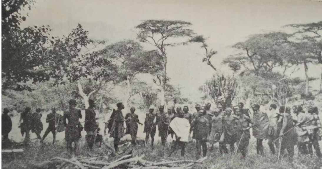
Figure 2: Hunters after a rest at Kerio Valley preparing to tackle the highlands

The movement of the animals hunted followed an obvious pattern associated with the rainy season and the consequent water supplies. During the dry season, there is a general concentration of these animals in more permanent swampy areas, and at sources like the Kerio Valley River or Lake Kamnarok. As the rains come, there is a great dispersal of the herds throughout most parts of the district, because of the temporal pools of water. Unfortunately, this season coincides with the growing season of the farms and fruit trees and the animals used to damage the crops. For instance, Moses Tanui (26/12/2021) a resident of Arror, narrated that, elephants practically invaded the area in December when the mangoes were ripe, and people tend to stay indoors at night during the period.