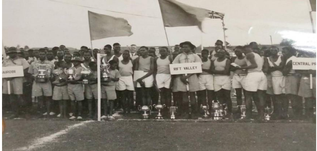
Figure 12: Rift Valley sports team winning the provincial shield for the second year with 41 points, Nairobi 2nd with 31 points