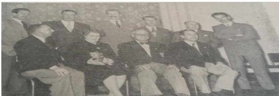
Figure 7: The Empire Games Organizing Committee of the Kenya Athletic Association.

take but the K.A.A.A immediately set about the tremendous task of finding the necessary finances to send a representative team to Canada. A way and means committee was formed which investigated the best method of travelling and decided that the team should fly to London and Vancouver, and return by train, ship and plane (East Africa Standard, 14 th December 1954). The committee also set out an appeal to raise $3,000, which the Kenyan government promised to support to the extent of $1 for every $ 1 collected. Companies, firms, African District Councils, schools, sports associations, clubs and individuals contributed to the fund, and it is a testimony to the work of the Ways and Means Committee and the response by the general public that the target was reached (African Sports Review December 1954:3).