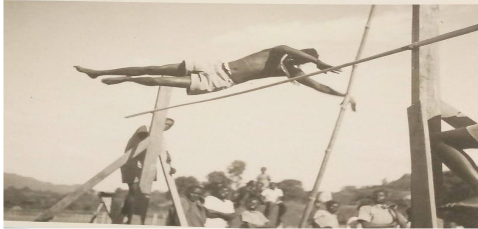
Figure 10: Elgeyo-Marakwet District Sports in 1951.