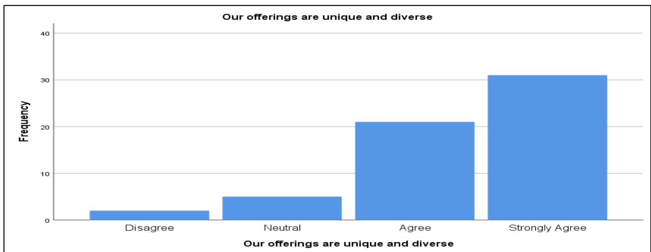
Figure 1 Unique and diverse offerings

findings, which revealed that five star hotels attempts to create tailor-made or customised hospitality services in an attempt to enhance their customer relationship management skills. In another study conducted by Maoto (2017), it was observed that five star hotels in Nairobi attempted to diversify on their products and services to enhance their operations, financial management, and innovativeness. Thus, it was agreed that product and/or service differentiation was a vital strategy used in the selected Five Star Hotels in Nairobi. The results were further demonstrated schematically as indicated below.