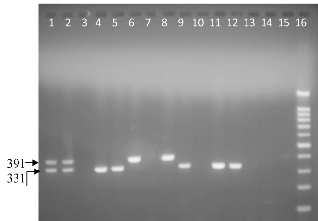
Figure 1. Ethidium bromide stained 1.5% agarose gel electrophoresis of Campylobacter coli (391 bp) and C. jejuni (331 bp) in a multiplex PCR with a 100-bp ladder. From left to right, lane 1 and 2 positive samples; mixture of Campylobacter jejuni and Campylobacter coli obtained from sequenced laboratory isolates (PHPT 1 & 2). Lane 3 negative control: purified water. Lanes 4, 5, 9, 11 and 12: C. jejuni . Lanes 6, 8 and 15: Campylobacter coli . Lanes 7, 10, 13 and 14: negative samples. Lane 16: 100-bp ladder.

Four MDR profiles were observed. All of the tested isolates were resistant to two or more antimicrobial agents, but the majority of isolates (84%) were resistant to all the antibiotics studied (profile 3 and 4). Campylobacter jejuni had the highest number of isolates that were MDR with 25 (37%) isolates being resistant to all four antibiotics tested (profile 1). C. coli had 23 (34%) isolates resistant to all the four antibiotics while C. lari had 9 (13%) isolates resistant to the four antibiotics. One (1.5%) C. jejuni and C. lari isolates was resistant to drugs in profile 2, while three (3%) C. coli isolates were in this profile. However, profile 4 had only one (1%) C. coli isolate while profile 4 had 2 (3%) C. lari , 4 (6%) C. coli and 5 (7%) C. jejuni MDR isolates (Table 4).