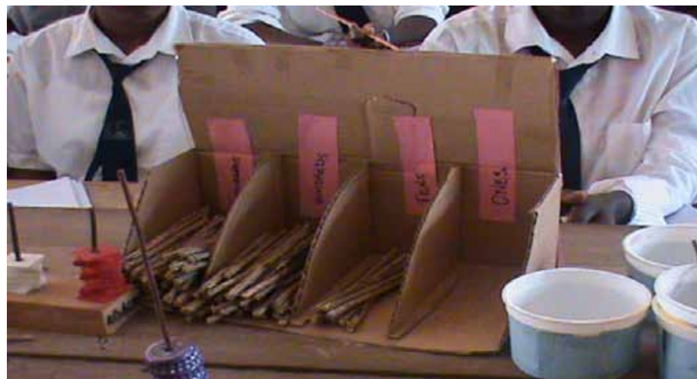
Teacher Trainees learn to use mathematics Teaching Learning Materials

Normally, teaching aids help in understanding more. When you use teaching aids, the children are able to understand more easily than if it is theory.