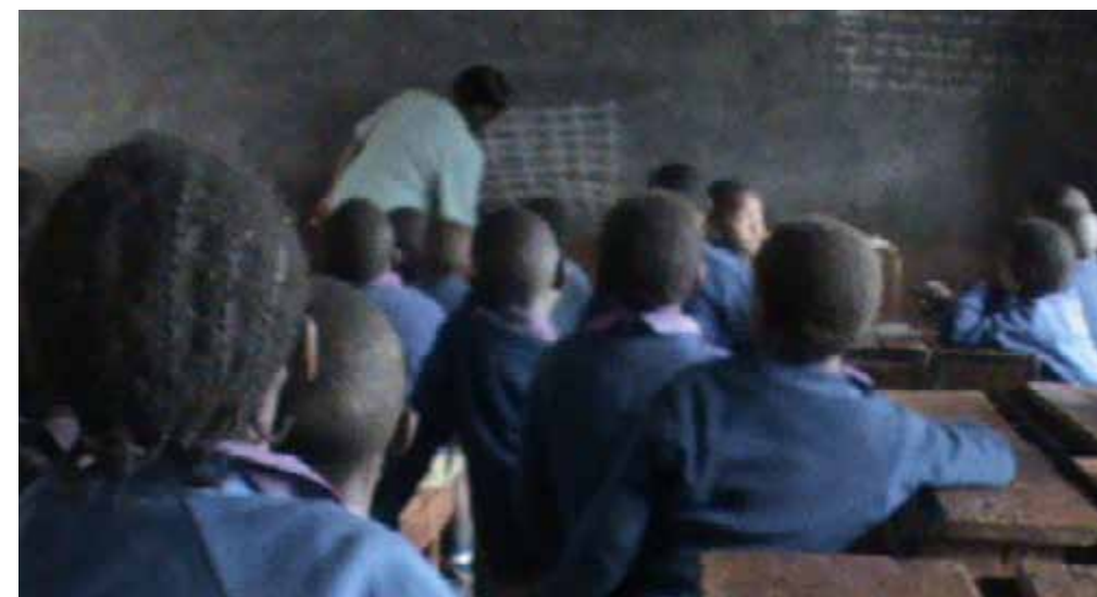
Key Resource Teachers(KRTs) organise children in groups

This group work helps so much because if you go to this group you understand how the group is and you understand the ones who are weak. When you are marking, the few questions you have given, it will help you to know the ones who are weak and then after that you will be able to help them.