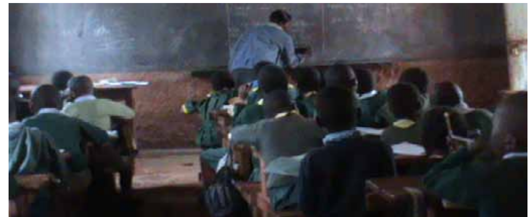
Children sit in rows facing blackboard and teacher

Throughout, the NQTs made strenuous efforts to engage students in activities usually involving manipulation of some TLMs such as pebbles, seeds and bottle tops, sticks, or the teacher or a student working a sum on the chalkboard while asking questions about what she/he was doing. However, NQTs did not use the TLMs judiciously to help students learn mathematics. In some cases, use of TLMs seemed to be an end in itself rather than a means to an end. For example, even when some learners could add correctly without using TLMs, the NQTs insisted on the learners using counters for educationally unsound reasons such as the need to wait until the whole class could use counters. Further, NQTs moved quickly from use of concrete materials to abstract ideas, not giving time for learners to make the connection between the manipulation of TLMs and the concepts they were learning.