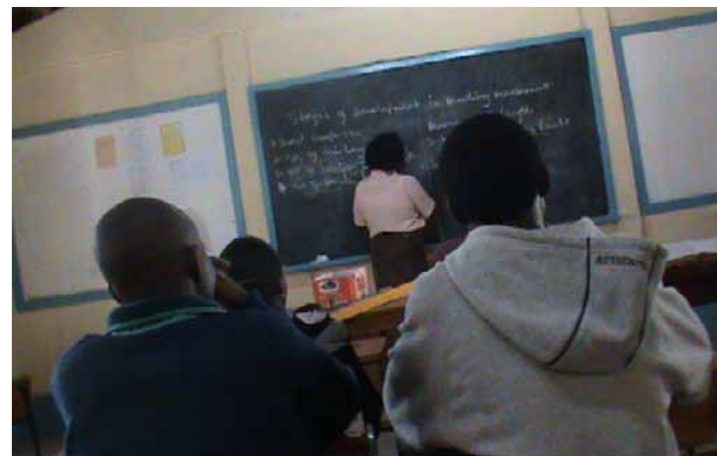
Teacher trainees learn methods for teaching mathematics

Teacher trainers used various methods in teaching how to teach lower primary mathematics including lecturing to the whole class with students taking notes, question and answer, and simulation in which a group of students pretended to be lower primary children and another student pretended to be their teacher; and demonstration of how to teach different concepts with TLMs. Generally, teacher educators were keen to mark out the steps or stages a teacher should use in teaching different concepts and operations and the fact that trainees should use TLMs. The problem with these methods is that they do not give children the opportunity to explore mathematical concepts and thus deepen understanding.