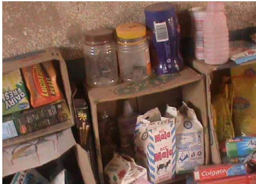
Teaching learning materials

Here, the teacher is referring to the case when the non-readers are separated from the others so that she can help them while the rest are in mixed ability groups with carefully selected group leaders who are themselves fluent readers and therefore can help the others with words they find difficult to read.