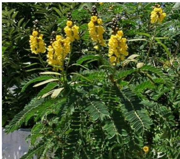
Cassia didymobotrya Fres. shrub

when its secondary metabolites are abundant. [16] Identification of the plant was done in the field and laboratory by a plant taxonomist from the department of pharmacognosy and pharmaceutical chemistry in Kenyatta University, after which a voucher specimen was deposited in the university's herbarium.