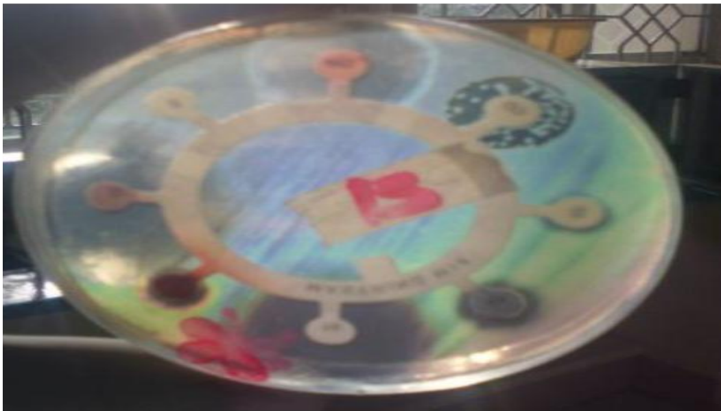
Arrows showing zones of inhibition for the plant extracts

A Petridish showing zones of inhibition for the standard disc, which contained among others Ampicillin and Gentamicin 10 µg respectively