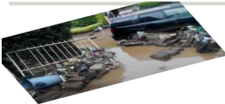
Figure 2: Behaviours of people deficient in basic core values.

India or included in all types of education because it plays a great role towards learners' personality and helps to become successful in their lifespans and careers as well. The absence of values makes people irresponsible as illustrated in Figure 2. The scenario carried in Figure 2 sends an alarming cumulative effect of our current education system that lacks core-values. In fact, we would benefit in terms of overall progress (good health, security and happiness) if our houses were mud-huts in communities that value our common good through providing good sanitation, food, education, drinking water, and basic health care.