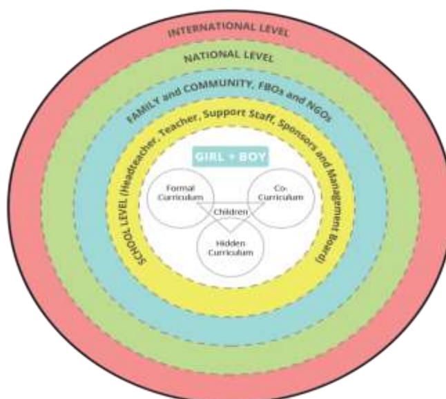
Figure 5 : Whole School Approach to Value-based Curriculum Development

Mainstreaming core-values, career preparedness attitudes as components of human development cannot be conceived in the absence of values. In this regard, an educational institution such as school, college or university should not be just confined to teaching and learning but it should be considered as a place where critical desirable values are cultivated (Kumar, 2015; Orodho,2017b). Hence, these desirable core-values and attitudes can be developed through a whole school approach education curriculum (Republic of Kenya, 2017).