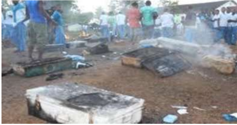
Figure 1: Students burn a school in Kenya

The immoral behavior is invariably as a result of lack of values which are principles, convictions or standards that influence a person's or community's conduct or actions in any situation. Values are the inner drive that explain why people behave or do what they do. They determine what a person considers important in life. When combined with knowledge, correct attitudes and life skills, values are what sustain a person's conduct. Thus, according to Indrani (2012), value shapes our relationships, our behaviors, our actions, and our sense of who we are. According to Kumar (2015), the value-based education is being taught in schools in