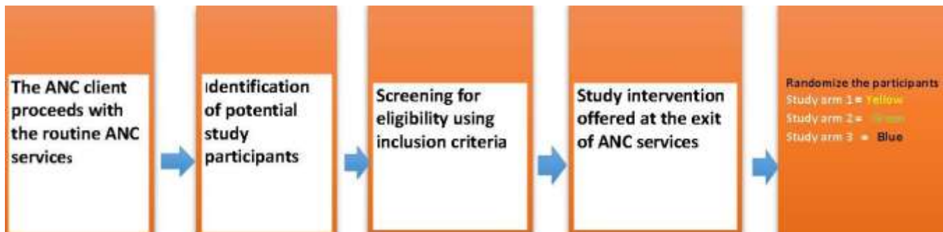
Figure 1: study process