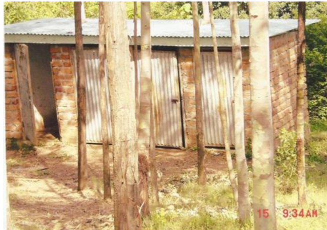
Figure 1: The state of toilet in a participating school.

There has been shortage of resources which include classrooms, desks, textbooks such as talking books for the blind, Braille machines for the blind and classrooms constructed using rumps to facilitate the movements of students with physical disabilities such as the lame and failure to embrace the assistive technology as most schools still use outdated technology to do even office work, hence cannot afford computer based assistive technology for their students with special Educational needs such as large prints, on screen reading, compact discs, and also talking calculators. These problems are evident in the dilapidated structures used as classrooms which cannot cater for the lame students and also the poor construction strategies used by designers of some facilities in some schools which include the library, laboratory, classrooms and toilets.