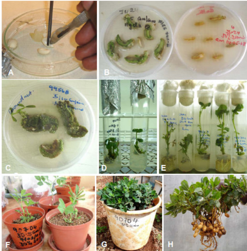
Figure 2. Regeneration of multiple shoots and plants from the cotyledon explants of groundnut. A) Preparation of cotyledon explants for in vitro culture. Aseptic removal of the embryo from a surface sterilized, uncoated seed of ICGV 90704. B) Comparison of NaOCl and HgCl 2 surface sterilization on the regeneration response in JL 24 after 14 days in culture. C) Shoot bud formation at the proximal end of explants of ICGV-99568 within 28 days of cultivation on SIM. D) Elongated shoots from two different varieties in SEM. E) Rooted plants of all 5 varieties used in this study on RIM. F and G) Acclimatized plants growing in the greenhouse and outside in soil. H) Mature pods harvested 4 months after hardening. About 30 - 40 seeds were recovered from each plant.

plants. Hence, the protocol is genotype independent and any of the varieties tested in this study will be suitable for future transformation studies with African groundnuts.